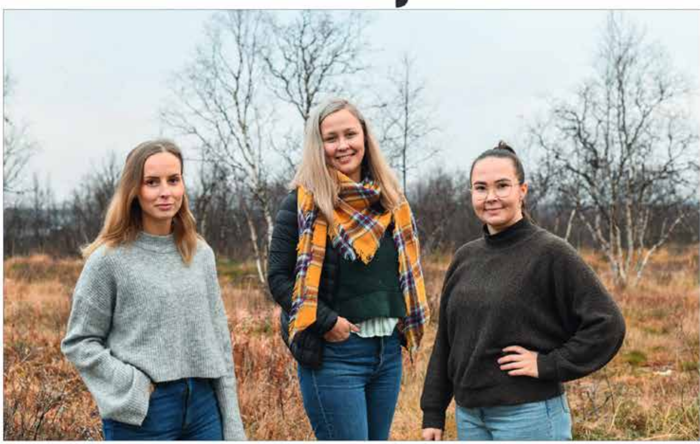
Guldalit Guovdageainnu suohkana covid-19 ávžžuhusaid, sirdet doaluid nehttii.

Dáiddadálu «EadnámetMaid» nammasaš deaivvadeapmi galggai čohkket akadmia, dáidagiid, jurdagiid ja olbmuid Guovdageidnui ja Mázii 5.-8.11 beivviid. Otná covid-19 dili geažil leat mearridan unnidit ja digitaliseret osiid EadnámetMaid prográmmas. Eará osiid manidit nuppe jah-